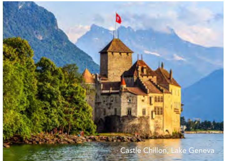
Castle Chillon, Lake Geneva