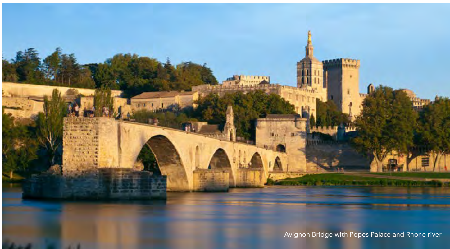
Avignon Bridge with Popes Palace and Rhone river